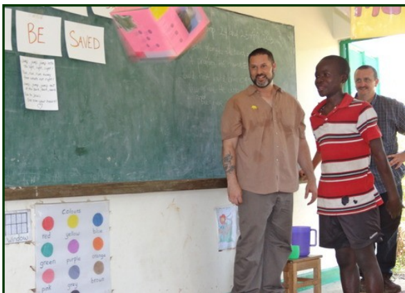
Here is one of the students at Manyatta, rolling the big dice! He must act like the animal that comes up on top while reciting the memory verse from Acts 16:31!